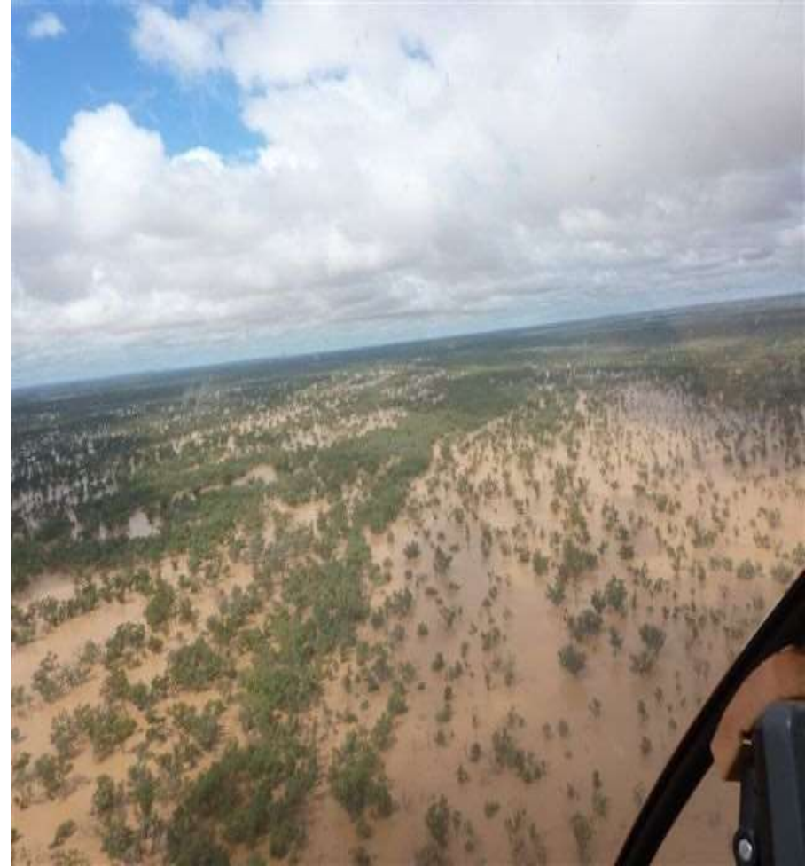
Western Plains in Flood 2012