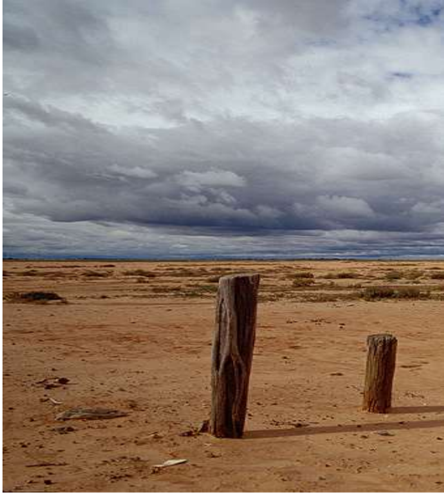
Western Plains in Drought 2010