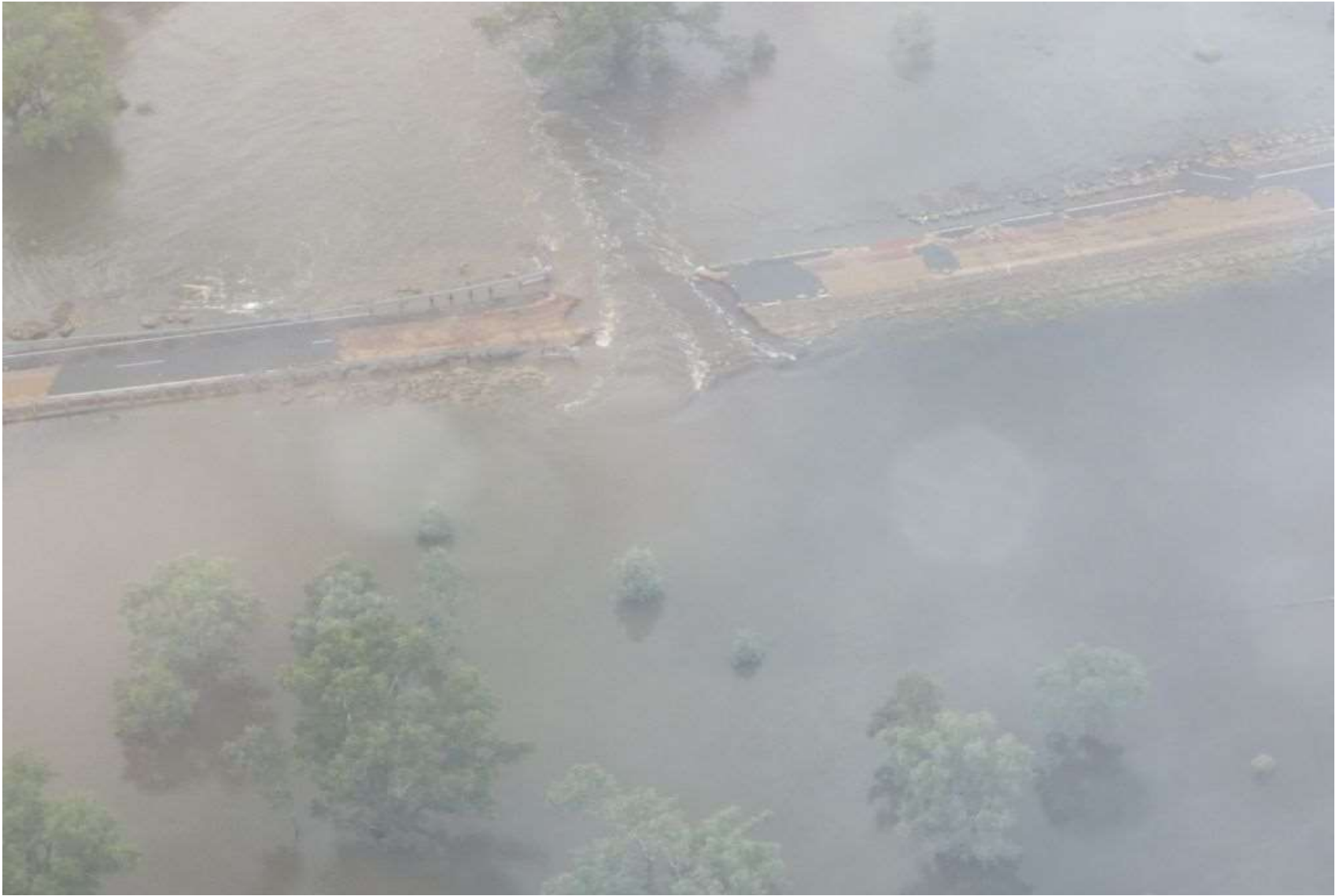
Road Between Walgett and Brewarrina 02/12